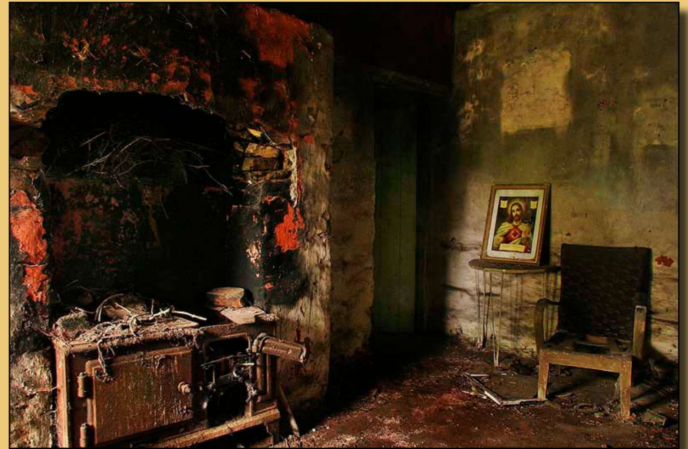
I have strived at all times not to move or arrange items but to photograph as found. DC