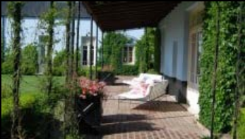
Pampa Chic Justino Esteves

11 people like this. Sign Up to see what your friends like.