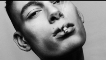
Portraits. “When I see purity”