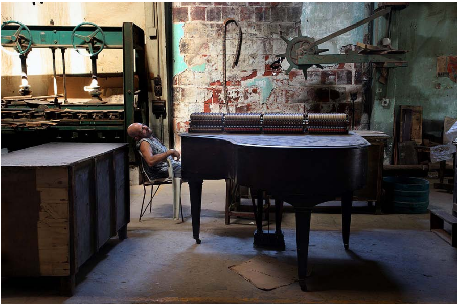
In the back streets of old Havana and a world apart from the tourist trade is the National Workshop of Instrument Repair.