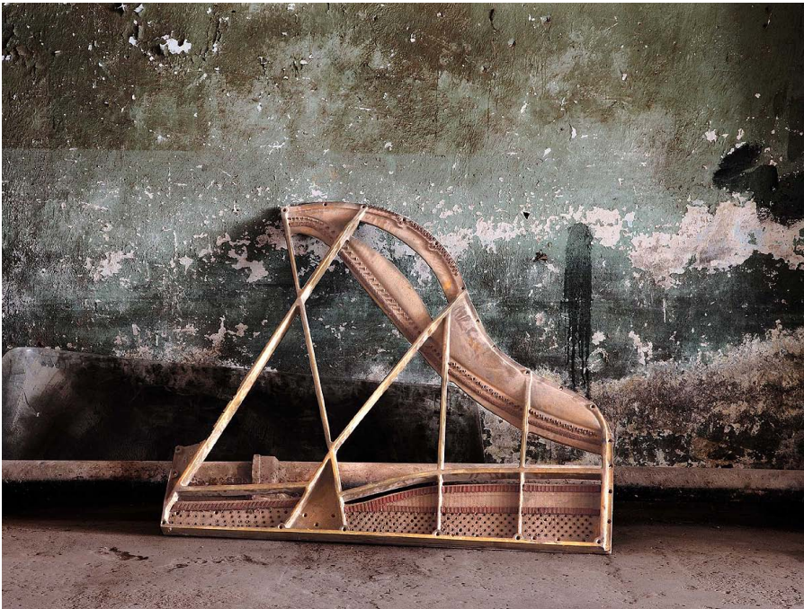
UNA CORDA – the soft pedal