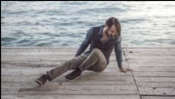
LEVIUS PRESENT THE NEW F/W 14 COLLECTION